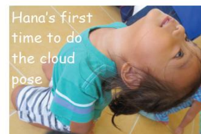
Hana's first time to do the cloud pose

Some of the yoga stories we had were "mountain adventure", "camel ride" and "jungle walk". In these stories, we execute yoga poses such as tree, cobra snake, bird, cloud, mountain, bridge, etc. The children can find their own way of moving their body and exploring how flexible their body can be.