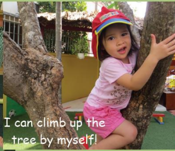
I can climb up the tree by myself!