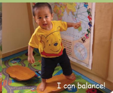
I can balance!