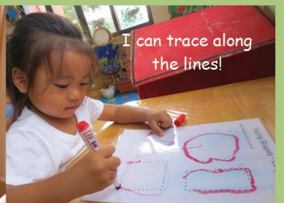
I can trace along the lines!