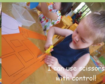
I can use scissors with control!