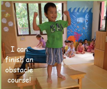
I can finish an obstacle course!