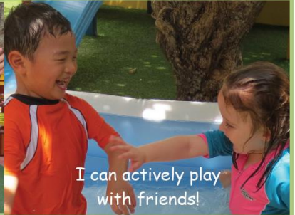
I can actively play with friends!