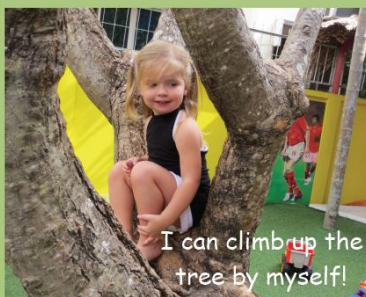
I can climb up the tree by myself!

Only four more weeks before the holiday but we still keep the excitement and fun growing in the Green Group!